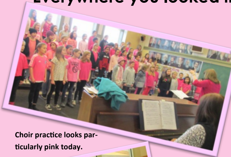
Choir practice looks particularly pink today.

Everywhere you looked it was a sea of PINK!!!