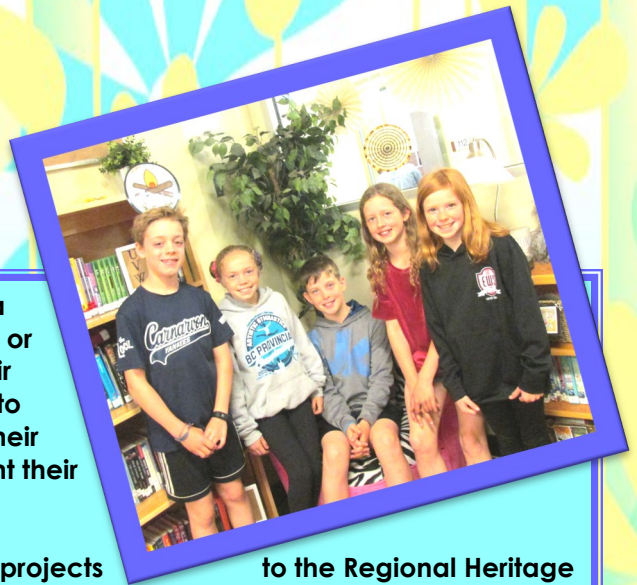
to the Regional Heritage

There were close to 80 children at the fair from all over the Island, so winning these awards is quite significant. The children not only worked hard but they had fun at the same time. Learning can be fun when you are interested in what you are studying.